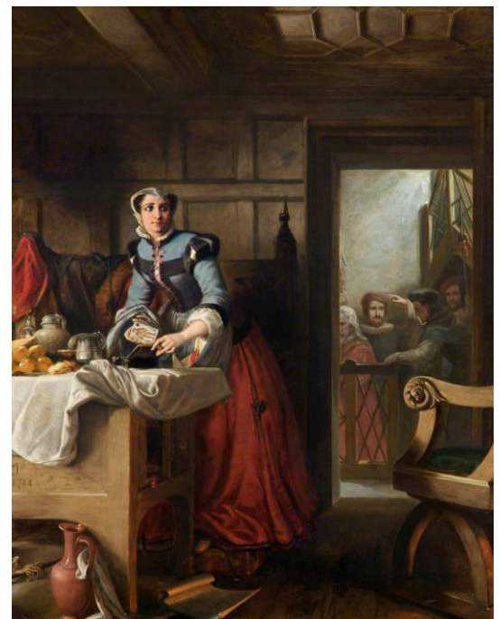
Legend of the Blue Posts Inn, Chester, 1558. Hung in Chester Town Hall. ix x